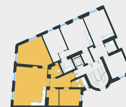
Location on the floor