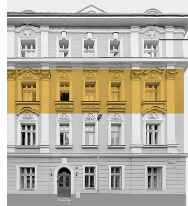
Position in the building

Floor area of the apartment according to Government Regulation No. 366/2013 Coll. means the total area of all rooms in the apartment as well as the area under load-bearing and non-load-bearing walls, cladding and cores (referred to here as vertical structures). This is an area that is defined by the perimeter walls of the apartment. The areas of individual rooms are indicative only. The equipment depicted in the apartment plans (furniture, kitchen, electrical appliances, etc.) is not part of the delivery. The scope of delivery is specified in the standard. The developer reserves the right to make changes.