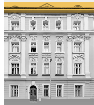
Position in the building

Floor area of the apartment according to Government Regulation No. 366/2013 Coll. means the total area of all rooms in the apartment as well as the area under load-bearing and non-load-bearing walls, cladding and cores (referred to here as vertical structures). This is an area that is defined by the perimeter walls of the apartment. The areas of individual rooms are indicative only. The equipment depicted in the apartment plans (furniture, kitchen, electrical appliances, etc.) is not part of the delivery. The scope of delivery is specified in the standard. The developer reserves the right to make changes.