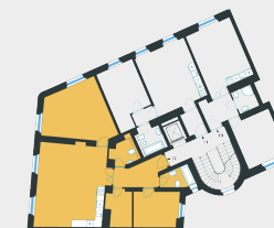
Location on the floor