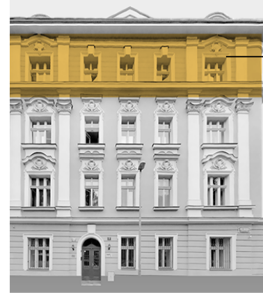
Position in the building

Floor area of the apartment according to Government Regulation No. 366/2013 Coll. means the total area of all rooms in the apartment as well as the area under load-bearing and non-load-bearing walls, cladding and cores (referred to here as vertical structures). This is an area that is defined by the perimeter walls of the apartment. The areas of individual rooms are indicative only. The equipment depicted in the apartment plans (furniture, kitchen, electrical appliances, etc.) is not part of the delivery. The scope of delivery is specified in the standard. The developer reserves the right to make changes.